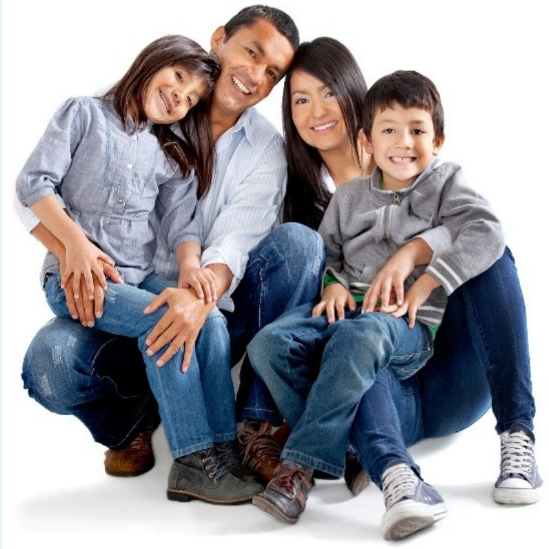
My lovely family (imagen